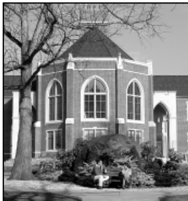
Grove City's Student Union Building

Each entering freshman receives a color notebook computer which is his or hers to keep upon graduation with a four-year degree.