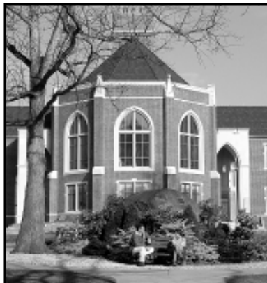
Grove City's Student Union Building

Each entering freshman receives a color notebook computer which is his or hers to keep upon graduation with a four-year degree.