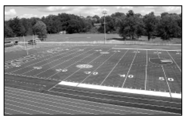
Grove City College installed CSTurf, lights and new track and field competition areas at Robert E. Thorn Field in summer 2006.

In addition, the PLC features the Grove City College Pool, one of the premier aquatic facilities in the region. Each year, Grove City hosts the Presidents' Athletic Conference Swimming and Diving Championships at the state-of-theart facility.