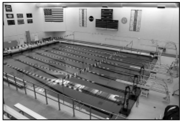
The Grove City College Pool is one of the nation's premier small-college venues for both swimming and diving and water polo.

The 1,800-seat Arena recently received new scoreboards, new scorer's tables and new shotclocks.