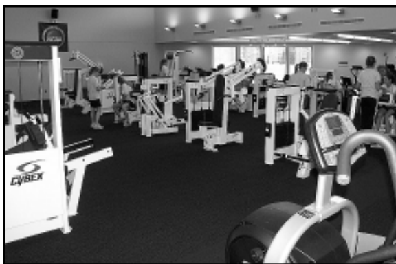
The Fitness Room in Grove City's Physical Learning Center features both state-of-the-art aerobic and Cybex technology.

Grove City's outdoor athletic facilities have also received numerous upgrades. The varsity soccer field, College Field, was expanded and re-sodded during the summer of 2005.