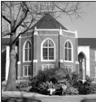
Grove City's New Student Union Building

Grove City College wants its students to be prepared in this age of mobile information technology. Each entering freshman receives a color notebook computer, software and a printer, which are his or hers to keep upon graduation with a four-year degree.