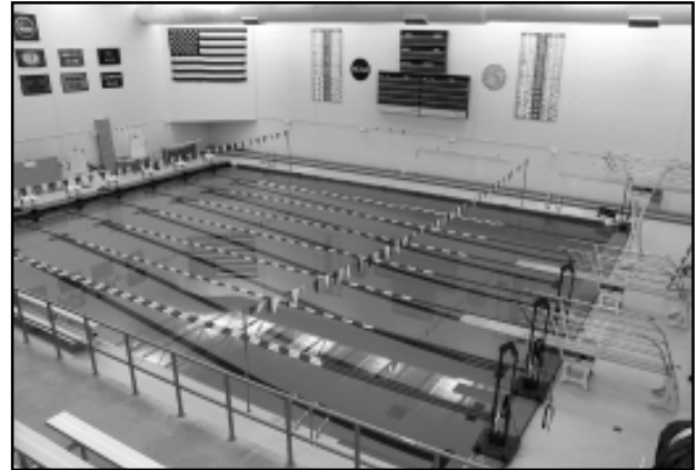
The Grove City College Pool is one of the nation's premier small college aquatic facilities and is home to the annual PAC Championships.

In addition, the PLC features the Grove City College Pool, one of the premier aquatic facilities in the region.