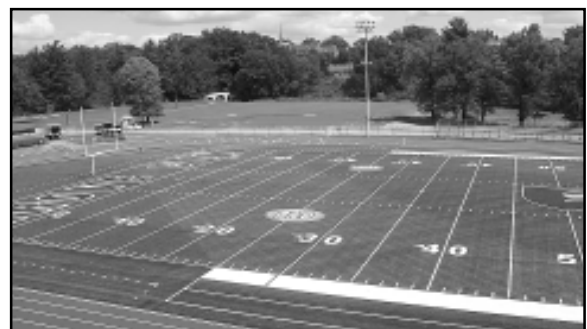
Grove City College installed lights, a new track and CSTurf at Robert E. Thorn Field during the summer of 2006.