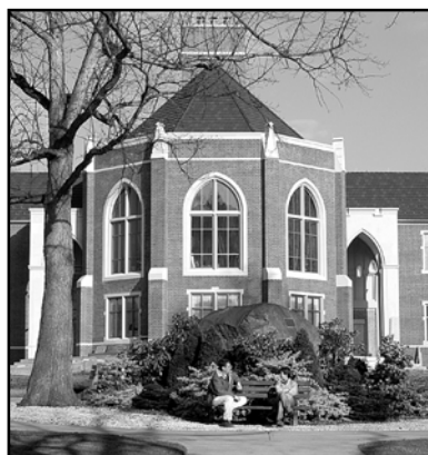
Grove City College's Breen Student Union

This is part of the Information Technology Initiative, a total program integrating technology across the curriculum.