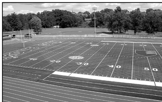
The home of Grove City's football and track and field teams, Robert E. Thorn Field has received numerous renovations in recent years.

In addition, the PLC features the James E. Longnecker Pool, one of the premier aquatic facilities in the region. Each year, Grove City hosts the Presidents' Athletic Conference Swimming and Diving Championships at the state-of-the-art facility.