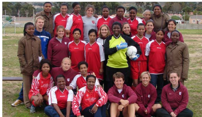
Team members (in maroon) pose with Pollsmoor Prison (red) and wardens (brown) after a friendly in Cape Town.

The first few days of the trip included orientation activities and learning the history of AIS and of its progress. The group also jumped right in to some ministry opportunities by running a soccer clinic on its second full day in town. This was the first of several clinics the group would lead during the trip. The clinics included time to work on specific soccer skills as well as time to witness. One of the ways the athletes conveyed their faith was