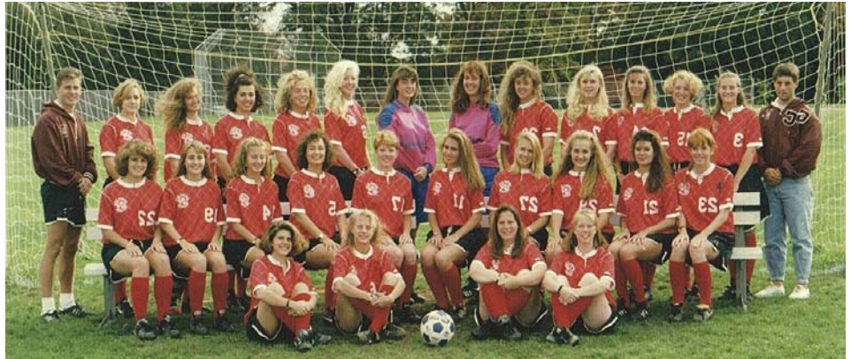
The 1992 women's soccer squad, pictured above, was Grove City College's first varsity team.