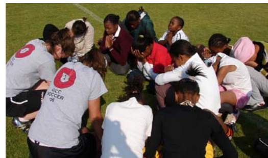
Team members brought their passion for God and soccer to South Africa this past summer.

The group spent the summer spiritually and financially preparing for the trip, which proved