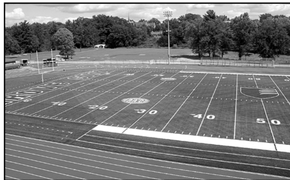
The home of Grove City's football and track and field teams, Robert E. Thorn Field has received numerous renovations in recent years.

In addition, the PLC features the James E. Longnecker Pool, one of the premier aquatic facilities in the region. Each year, Grove City hosts the Presidents' Athletic Conference Swimming and Diving Championships at the state-of-the-art facility.