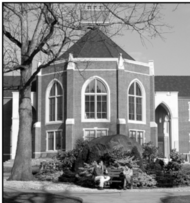
Grove City College's Breen Student Union

This is part of the Information Technology Initiative, a total program integrating technology across the curriculum.